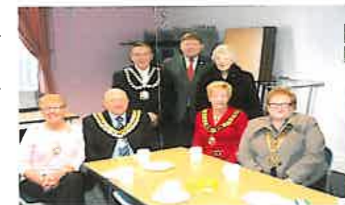
Civic Dignitaries with Parish Council Chairman at Macmillan Charity Coffee Morning

cer. The event took place in December and was attended by civic dignitaries for Peterlee, Seaham, Hartlepool, Durham, and operational problems. However, the lights did manage to be put on and looked as good as ever.