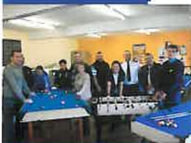
Organisers of Board for Bored Games enjoying the new equipment