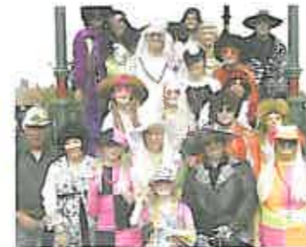
Staff of Horden Parish Council with Friends of the Welfare Park and other volunteers at the Heritage Fun Day 13th September 2009