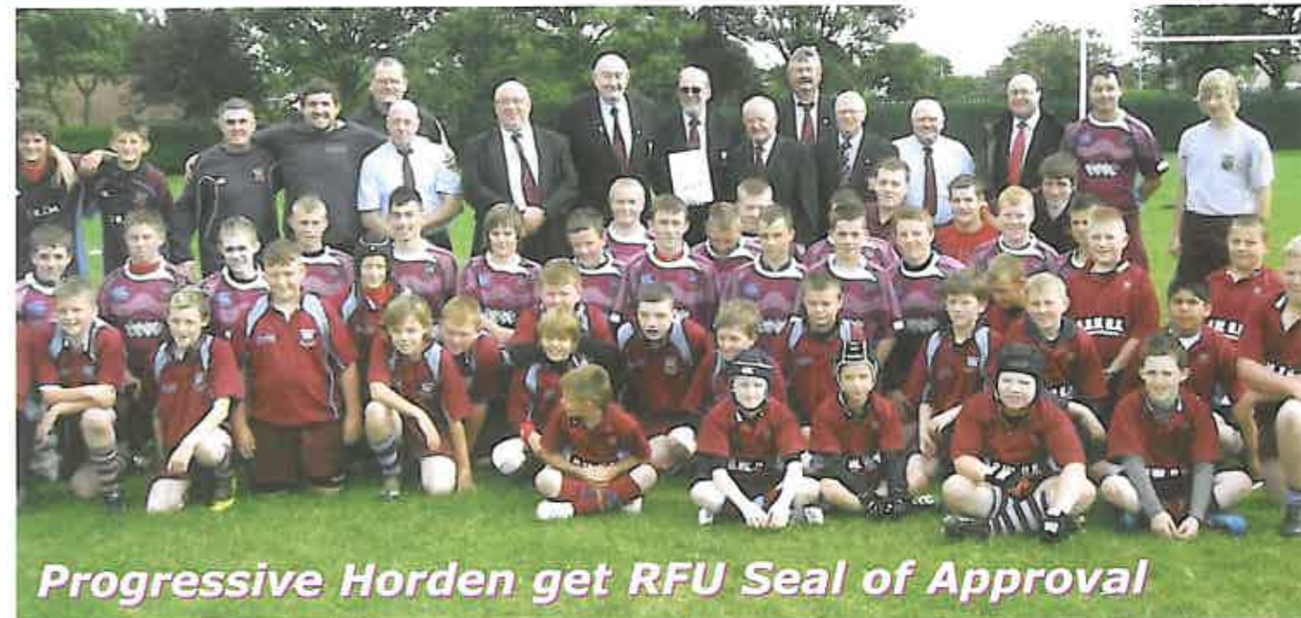
Progressive Horden get RFU Seal of Approval

Horden RUFC have joined the list of Rugby Union clubs in the North East who have been accredited with the RFU's Seal of Approval and Sport England's Clubmark for their Mini and Youth section.