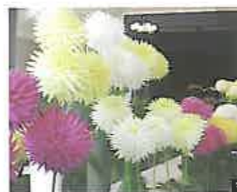
Display of Flowers from the Flower and Vegetable Show held in August 2009